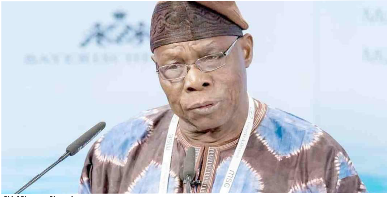
Chief Olusegun Obasanjo

"We see your disrespectful statements at the commissioning of the Ladoke Akintola University of Technology (LAUTECH), Iseyin campus, and had commanded kings from Oyo State to stand up and accord you respect (and subsequent defence in premium times); to the arrays of first-class Royal Fathers and other leading Obas like toddlers or a village