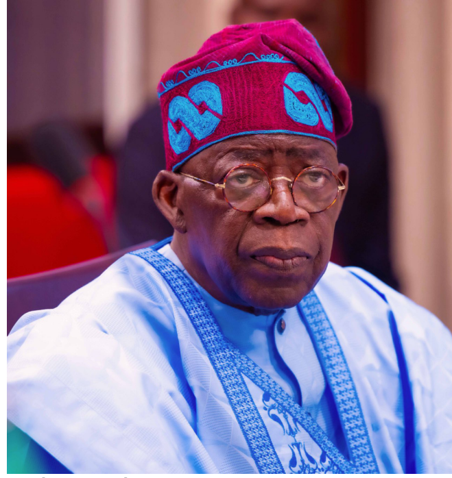
President Bola Tinubu

Governor Soludo, as governor of the Central Bank of Nigeria, CBN, temporarily introduced a measure, a certain percentage (if memory serves me correctly, it was 10 per cent) of the monthly allocations of the states was paid in dollars. It was controversial at the time; but I fully supported it. What was fascinating to me was the opportunity for states to develop the knowledge and skills