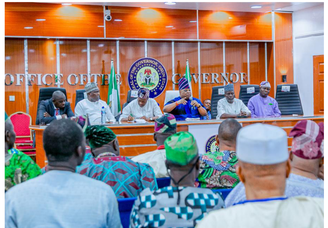
Governor Ademola Adeleke holding a peace accord meeting between Ilobu and Ifon communities to settle the communal clash between them at the Governor's office, Osogbo