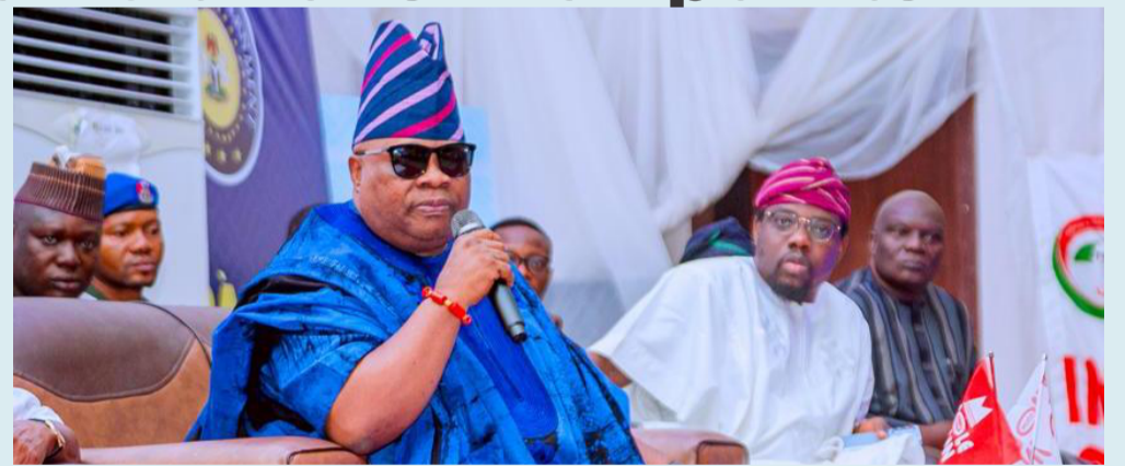
The Maiden edition of Ipade Imole, a quarterly accountability programme of the Ademola Adeleke-led Osun State Government held on the 5th of October, 2023 at Aurora Events Centre, Osogbo