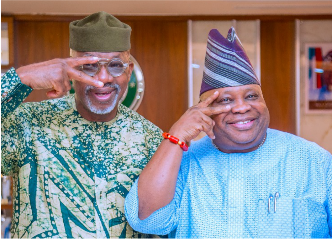
Governor Dapo Abiodun of Ogun State and Governor Ademola Adeleke of Osun State at the Ogun State Governor's office, Abeokuta.