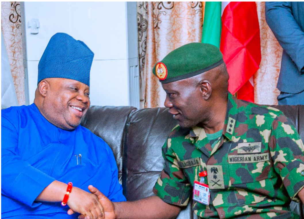
Osun State Governor, Senator Ademola Adeleke; Chief of Army Staff, Lieutenant General Taoreed Lagbaja, at the Ede Country home of the Governor.