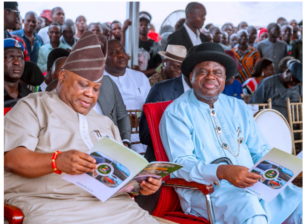
L-R: Osun State Governor, Senator Ademola Adeleke; Governor Duoye Diri of Bayelsa state at the commissioning Elebele AIT Road in Yenegoa, Bayelsa state.