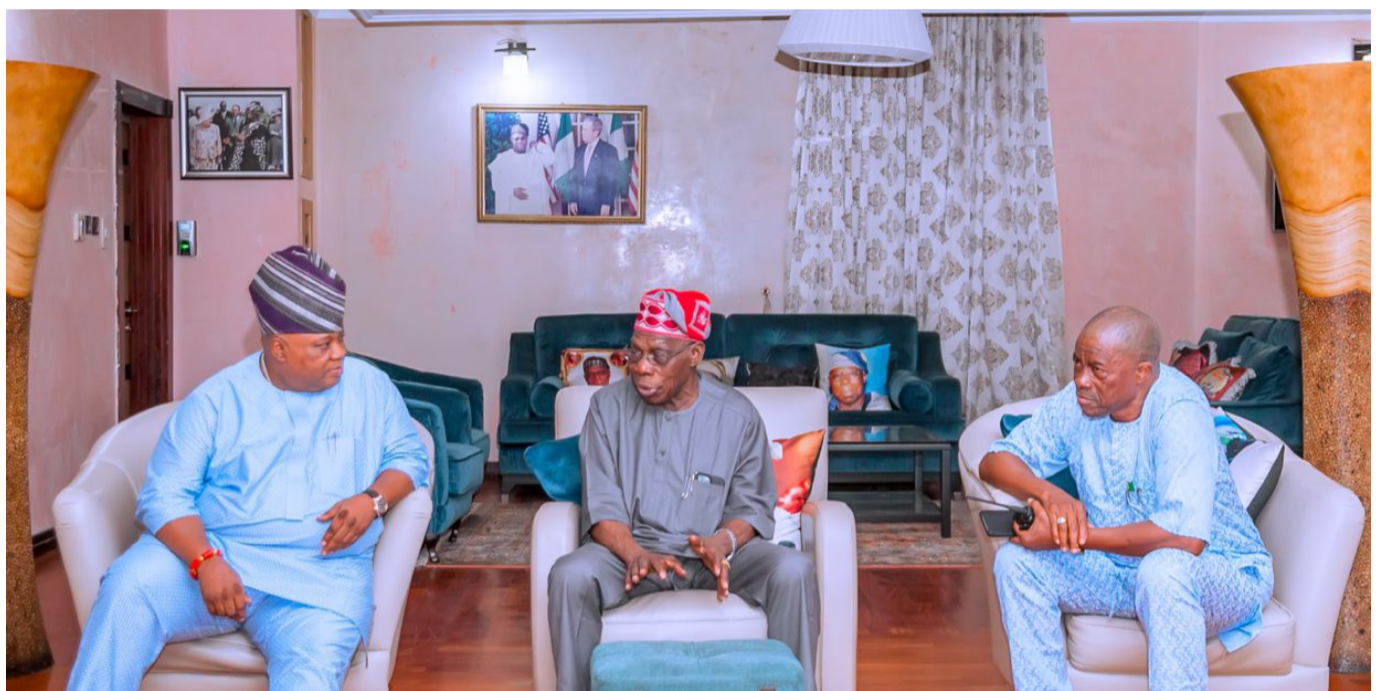
L-R, Osun State Governor, Senator Ademola Adeleke; Former Nigerian President, Chief Olusegun Obasanjo; Osun State Deputy Governor, Prince Kola Adewusi at the former president's residence in Abeokuta.

"Instead of advocating for a return to power, it would be prudent for Basiru to humbly seek forgiveness from the people even if he lacks the moral stamina to address the carnage of his party's reign in the state.