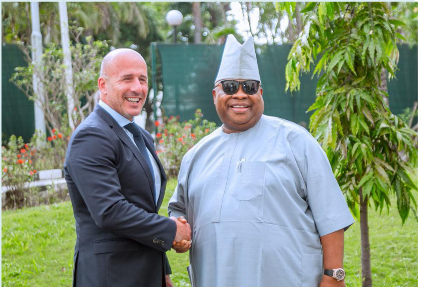
L-R: Canadian High Commissioner, James Christoff; Osun State Governor, Senator Ademola Adeleke

Osun's strategic location in the Southwest, which facilitates the movement of agricultural produce", the Governor was quoted as saying, adding that "our plans for a cargo airport, the presence of a sub-power station that will