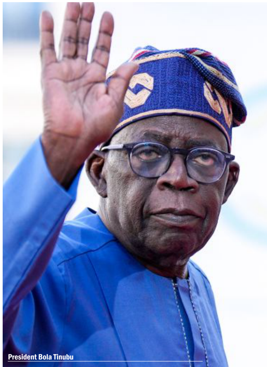
President Bola Tinubu

Nigerians are made to believe that fuel subsidy is evil and anti-masses, while Mr. President at the point of inauguration declared its total removal. Ever since this official pronouncement on national television, the