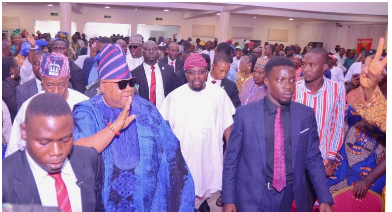
Osun State Governor, Senator Ademola Adeleke