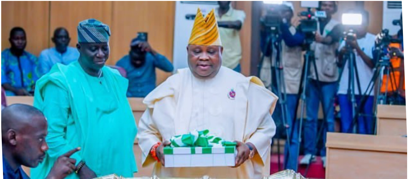
Osun State Governor, Senator Ademola Adeleke present the Osun State Budget Estimation for the 2024.

delivering on our five point agenda for better life for our people", the Governor was quoted as saying.