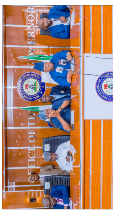
Governor Ademola Adeleke and other Executive Council members in a meeting with officials of Segilola Resources Limited as Osun government resuscitates shareholding deals