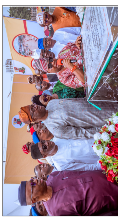
Governor Ademola Adeleke of Osun State Commissions 8.2km Dualized Road Constructed By Oyo state Governor, Engr Seyi Makinde