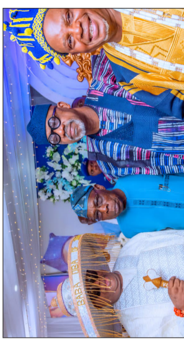
Installation of Osun State Governor, Senator Ademola Adeleke as the Baba Oba of Joga-orile, Ogun state