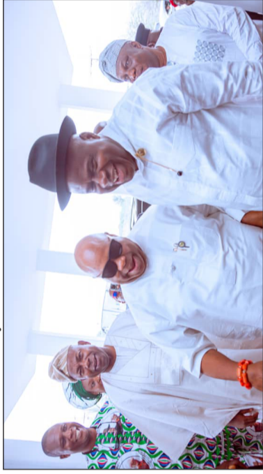
Governor Ademola Adeleke of Osun State at the second term swearing in ceremony of Governor Duoye Diri of Bayelsa in Yenagoa, Bayelsa state