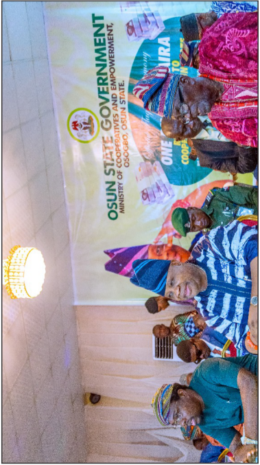
Governor Ademola Adeleke at the Official Flag off Ceremony of the 1 Billion Naira Revolving Loan to Cooperatives in Osun State