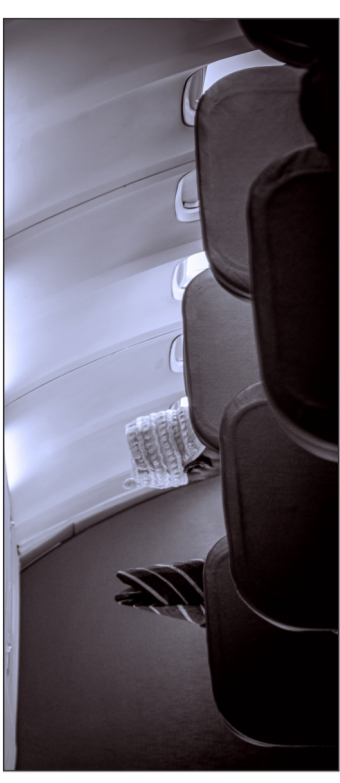
A soaring journey through the skies—a presence symbolizing a bond of mutual respect and shared aspirations for the land of Oduduwa; a testament to an enduring legacy for generations to come ~@moronfoluwa08