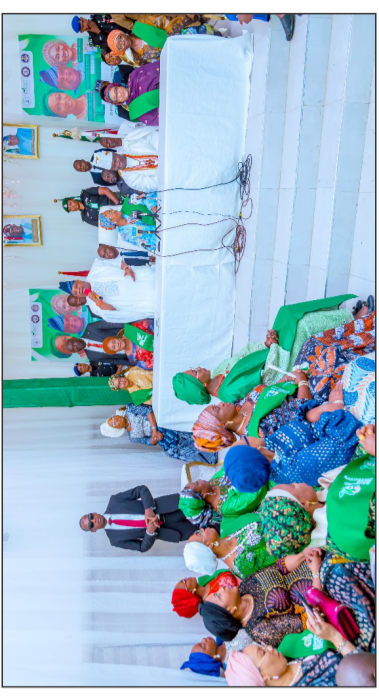
Governor Adeleke Hosts First Lady of Nigeria, Senator Oluremi Tinubu