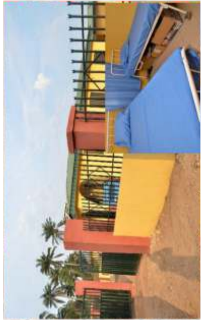
Front view after renovation