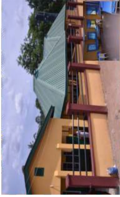
Front View after renovation with new fence and gates