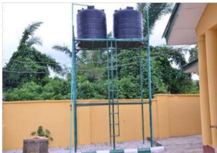
Water storage stand after renovation