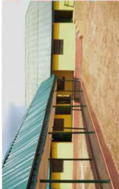
Front view with newly constructed walk-way after renovation