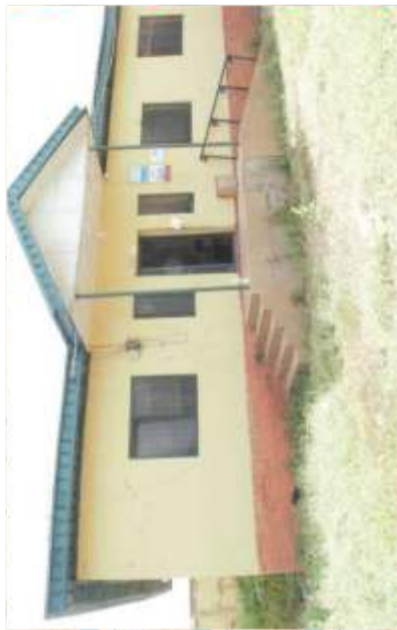
Front view before renovation