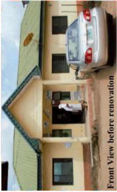
Front View before renovation