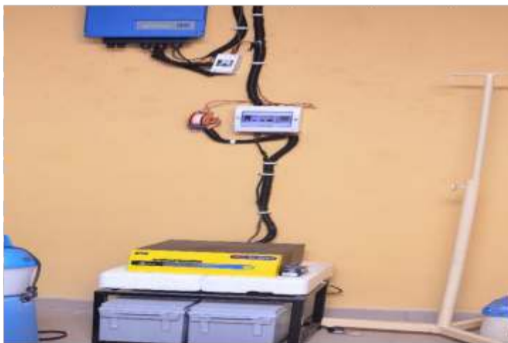
Solar inverter system for powering the facility