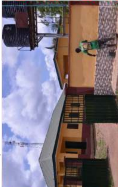
Front view after renovation