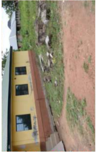
Surrounding before renovation