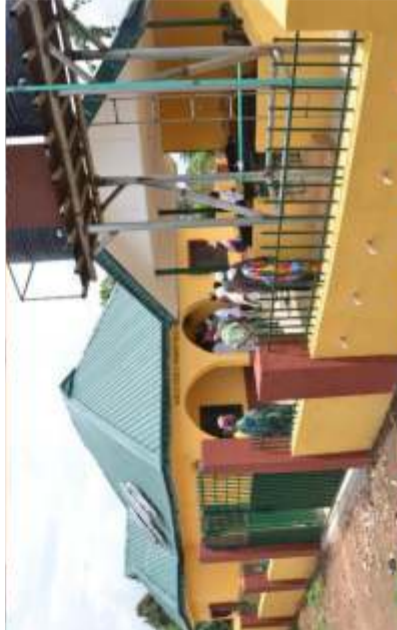
Front view after renovation