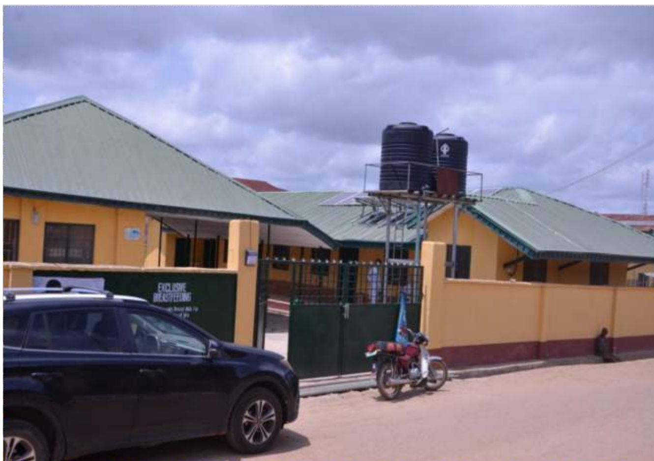
OJA TIMI PHC, EDE NORTH