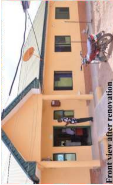
Front view after renovation