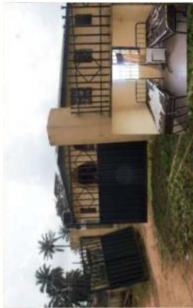
Front view before renovation