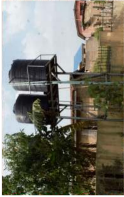
Front view before renovation