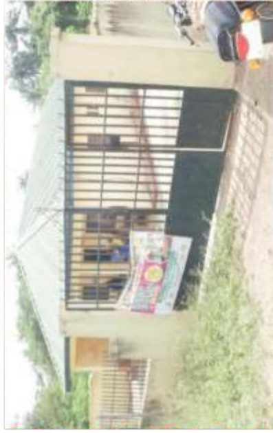
Front view before renovation