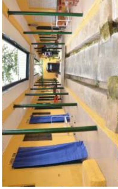
Surrounding after renovation