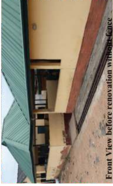
Front View before renovation without fence