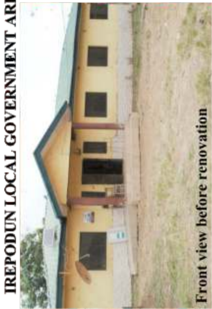
Front view before renovation