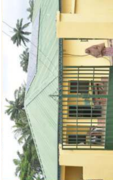
Front view after renovation